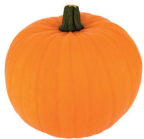
Large pumpkin, hollowed out