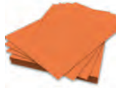
Paper to cut out into Halloween shapes