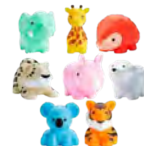
Toys based on the child's interests